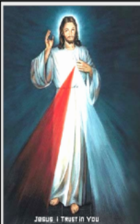
JESUS I TRUST IN YOU

***The Sacrament of Reconciliation will be available before and during the hour, you may also receive the Sacrament of Reconciliation, prior